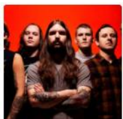
HANLINGSPLAN: januar '14