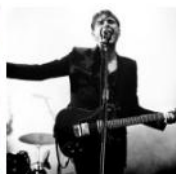
Franz Ferdinand nye kommende skiva