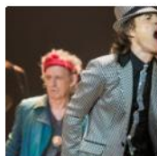
The Rolling Stones ga ut en album- overraskelse