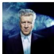
Den store drømmen til David Lynch